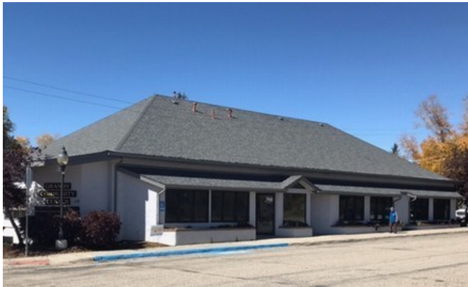
Granby Community Center

Raffety Park & Soccer Dome: 245 West Diamond