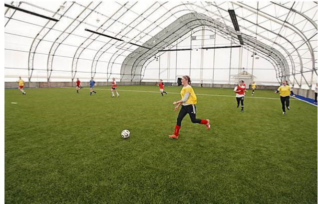
Granby Soccer Dome