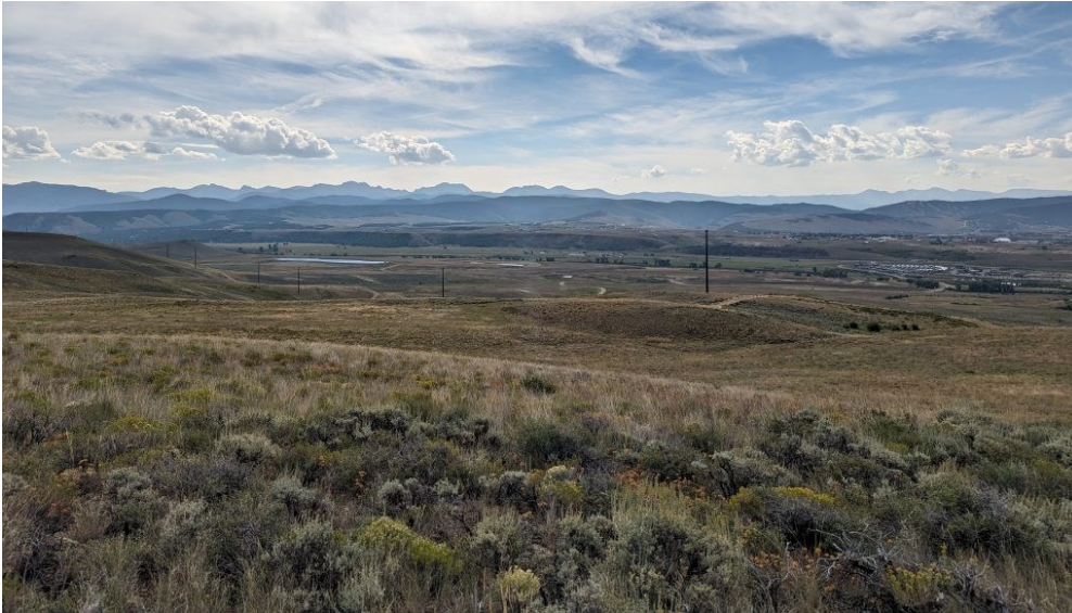
Photo of Town-owned land recently put into a conservation easement.