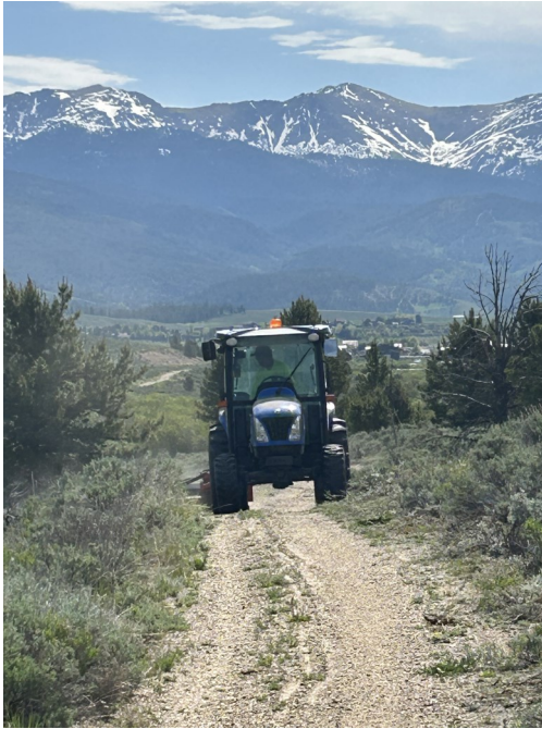
Photo: A Public Works employee doing trail maintenance on the Fraser to Granby Trail.